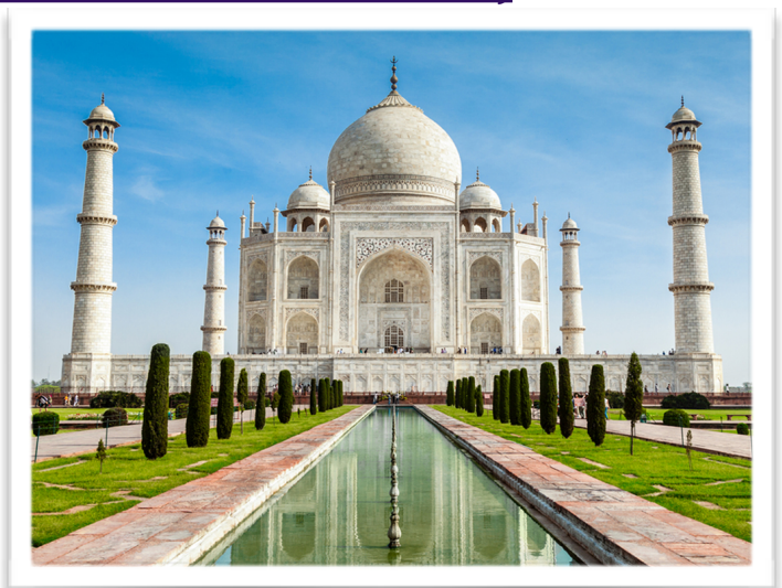
Taj Mahal - UNESCO World Heritage Site

April 7: Singapore (with possible extension)